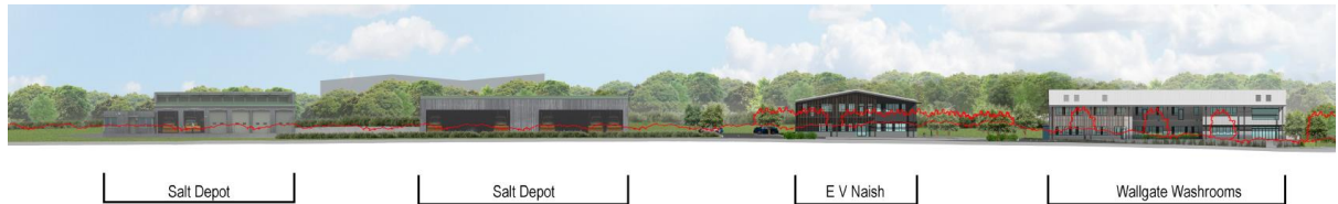
View from the West

the visual presence within the landscape. Both buildings have low profile roofs to further minimise the impact of the buildings. The servicing area for vehicle manoeuvring is shown to be between the two buildings to again reduce the visual impact of the development on the surrounding area. Vehicle parking for staff and visitors is shown adjacent to the Salt Barn boundary to serve the Naish Felts building, and along the western boundary to serve the Wallgate building. Both parking areas have spaces dedicated for electric vehicles with charging points, and provision has been made for cycle storage, including electric charging points for cycles.